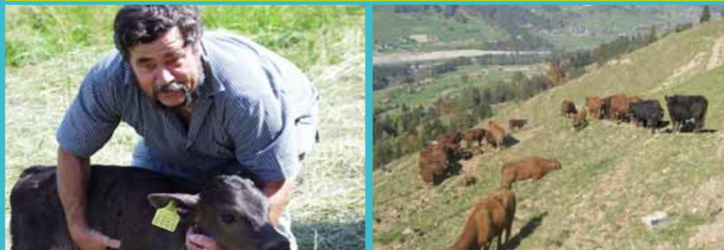
Naturabeef: Swiss example of chain innovation