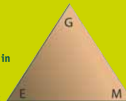
Pecorino: Italian example of territorial embedding