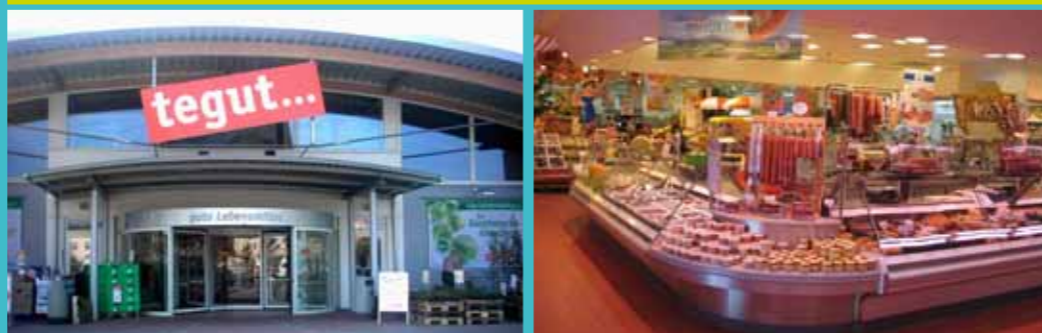
Tegut: German example of chain differentiation